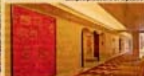
Artworks at the Kala Cartoon, Bangalore