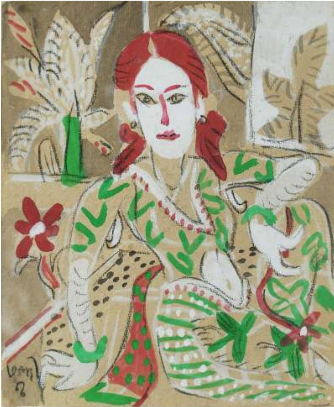
Artist : K G Subramanyan Title : Seated Figure Medium : Gouache & Wax Pen Size : 8.5 x 7 Inches