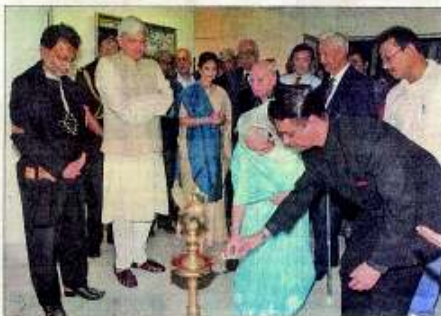
Sarala Birla lights the inaugural lamp at Creativity at the Birla Academy of Art and Culture on Tuesday as Governor Gopal Krishna Gandhi looks on.