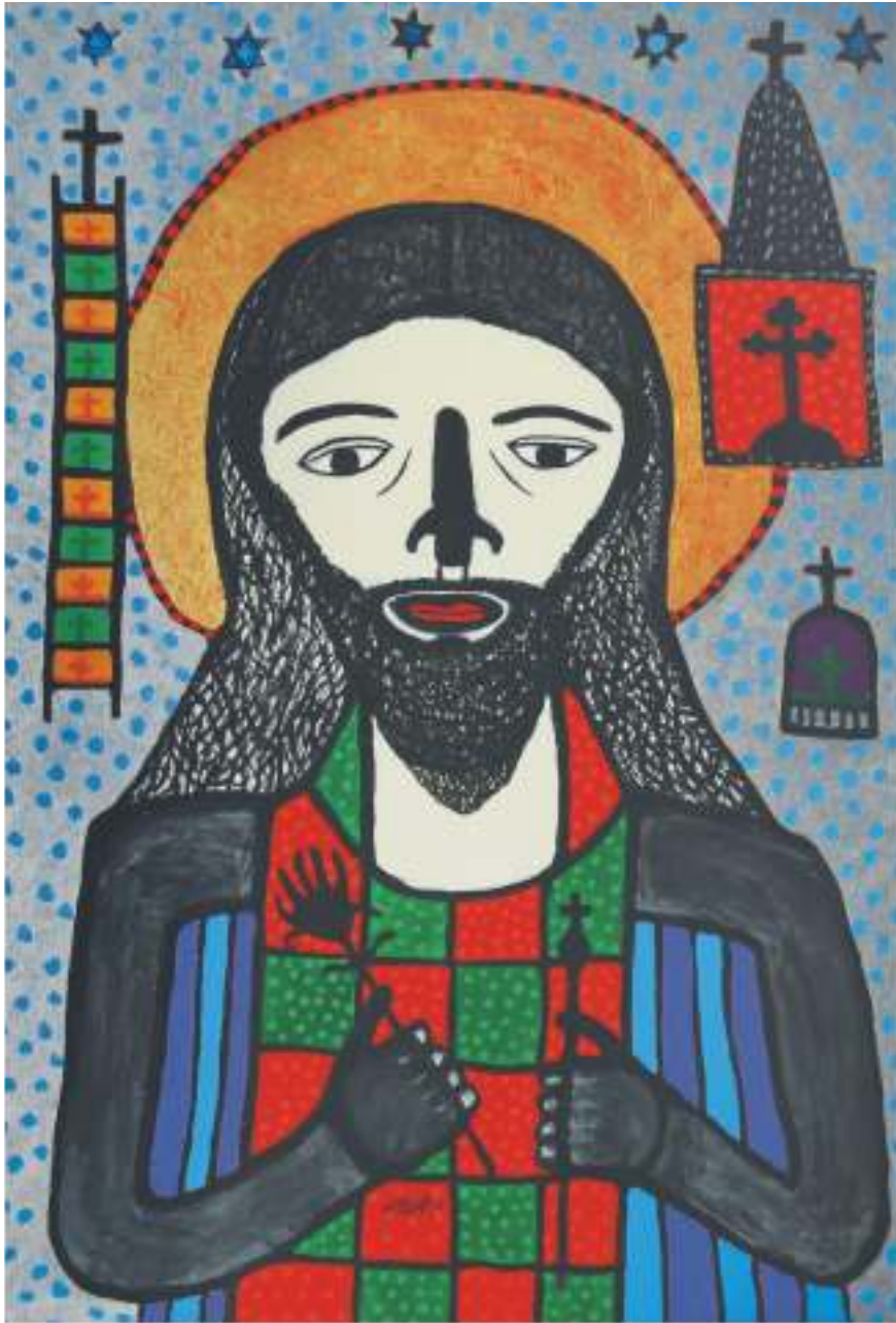
Artist : Madhvi Parekh Title : Christ Medium : Acrylic on Canvas Size : 24 x 36 Inches